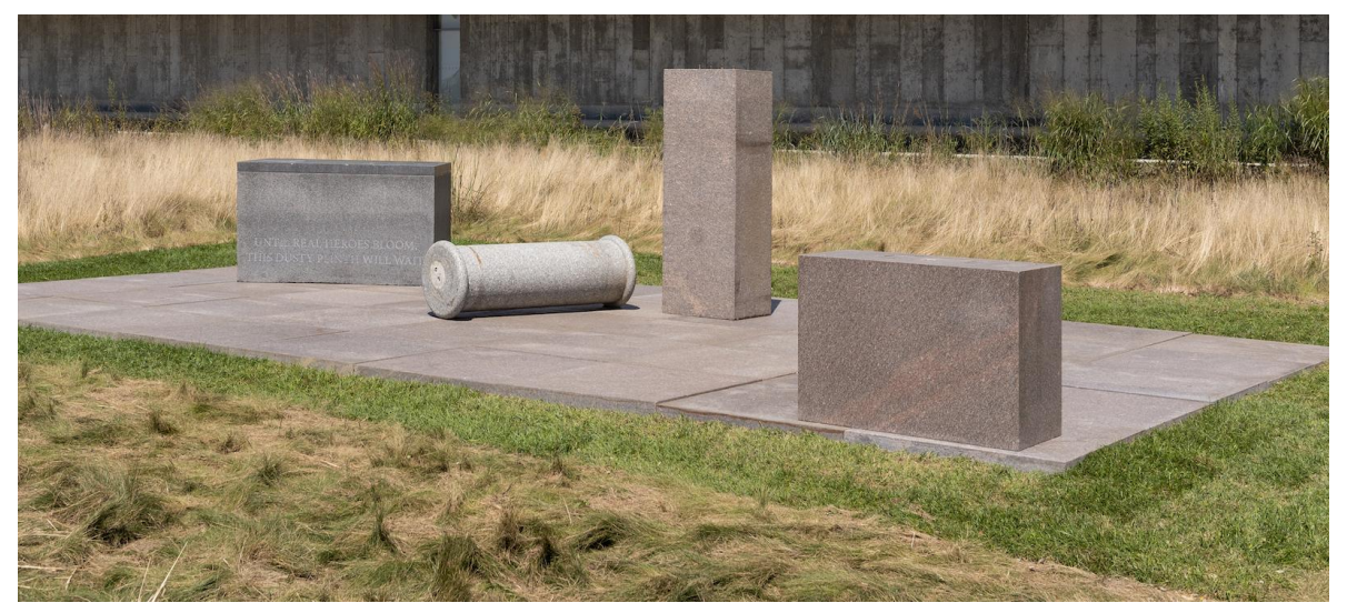
Previously installed at the Parrish Art Museum, as seen above, the sculpture is now on view at Drexel. Theaster Gates, Monument in Waiting , 2020.

With Monument in Waiting , Gates responds to the removal of Confederate and colonialist monuments and acknowledges the role of monuments in marking histories of injustice. The artist draws viewers through the installation, into a space for confronting these historical truths, and of aspiring collectively toward a future built upon equal justice. Gates interrogates long-held notions of heroism, fashioning pedestals that allow us to reconsider and expand the possibilities for valiant acts. As an inscription engraved on one of the plinths reads, "Until real heroes bloom, this dusty plinth will wait."